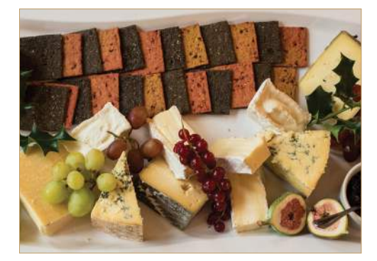
Supplement indicated on separate price list.

A Chef's selection from a choice of Cheddar, Stilton, Smoked Cheddar, Brie and Oxford Brie delivered on a platter to each table served with savoury crackers & orchard fruit chutney